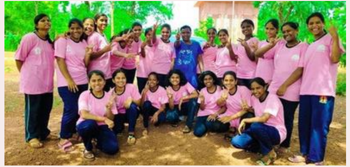
(Group picture of the team after the kabbadi match)

Our recent sports event was a vibrant celebration of athletic prowess and teamwork, bringing together participants in a wide array of activities. The event kicked off with a grand marchpast, where teams showcased their unity and enthusiasm. The competition was fierce and thrilling, with volleyball matches displaying remarkable agility, kabaddi games highlighting strength and strategy, and table tennis rounds requiring precision and quick reflexes. Football, the most anticipated event, captivated everyone with its fast-paced action and skillful play. The event was a resounding success, embodying the true spirit of sportsmanship and camaraderie.