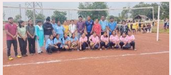
(Group Picture of the team after the volleyball Match)