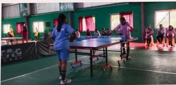
(Table Tennis match between LH and MKH)