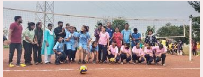
(Group picture of the team after the football Match)