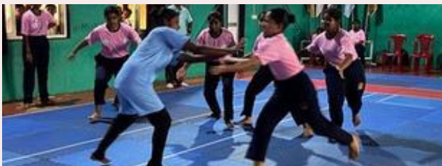
(Kabbadi Match Between LH and MKH)

Our recent sports event was a vibrant celebration of athletic prowess and teamwork, bringing together participants in a wide array of activities. The event kicked off with a grand marchpast, where teams showcased their unity and enthusiasm. The competition was fierce and thrilling, with volleyball matches displaying remarkable agility, kabaddi games highlighting strength and strategy, and table tennis rounds requiring precision and quick reflexes. Football, the most anticipated event, captivated everyone with its fast-paced action and skillful play. The event was a resounding success, embodying the true spirit of sportsmanship and camaraderie.