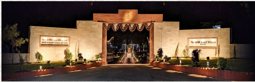
The Gateway of Knowledge!

Also, the classrooms have been modernized. Digital panels for effective learning have been installed in each class for interactive teaching learning. Not to forget the blooming Sports Academy which has recently recieved a new Tennis court and a renovated basketball court.