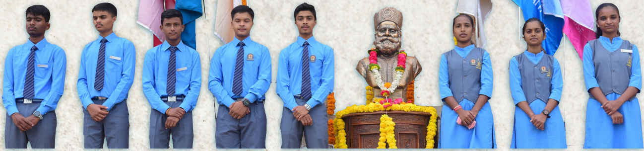
Our Leaders Smiling and Shining in Blue!

The investiture ceremony at The Manik Public School, held on 13th July, 2024, marked a significant occasion where student leaders were bestowed with responsibilities and duties to uphold the values and ethos of the school. The event commenced at 8:25 A.M. in Siddharaj Cricket Stadium with an atmosphere of pride and